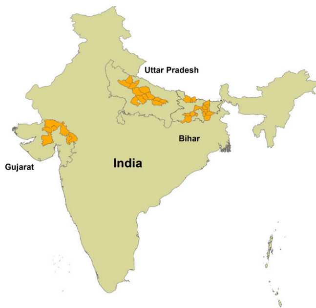
FIGURE 1. Districts included in data collection by state. 19,20 Twelve selected districts in UP (Ambedkar Nagar, Badaun, Bara Banki, Bareilly, Faizabad, Hardoi, Kanpur Dehat, Lucknow, Shahjahanpur, Sitapur, Sultanpur, and Unnao); 6 selected districts in Gujarat (Banas Kantha, Dohad, Panch Mahals, Patan, Sabar Kantha, and Surendranagar); 15 selected districts in Bihar (Banka, Bhagalpur, East Champaran, Gaya, Jehanabad, Khagaria, Madhepura, Munger, Nalanda, Saharsa, Samastipur, Sheikhpura, Sheohar, Sitamarhi, and Supaul).

the 2 weeks preceding the survey. In each village, data collection continued until either all households within the village were visited or the survey was administered to a maximum of 50 caregivers. Ethical approvals for all phases of the study were obtained from the Johns Hopkins University Institutional Review Board in Baltimore, MD and from the Society for Applied Studies Ethical Review Committee in New Delhi, India.