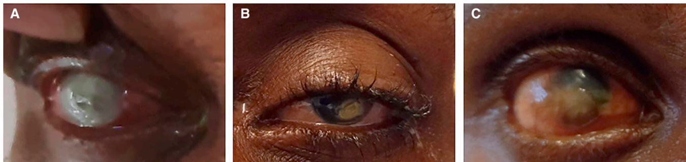
FIGURE 2. Select clinical examples of corneal ulcers in Blantyre, Malawi (A) Aspergillus flavus , (B) Subramaniula asteroides , (C) Alphapapillomavirus 7 .

and a corneal ulcer (Figure 2C). Data on the prevalence and etiology of vision loss in Malawi are limited. Access to specialized ophthalmic care including microbiology services is similarly limited. Surveillance of infectious disease etiology is an important first step in allowing for best practice early intervention for patients with corneal ulcers.