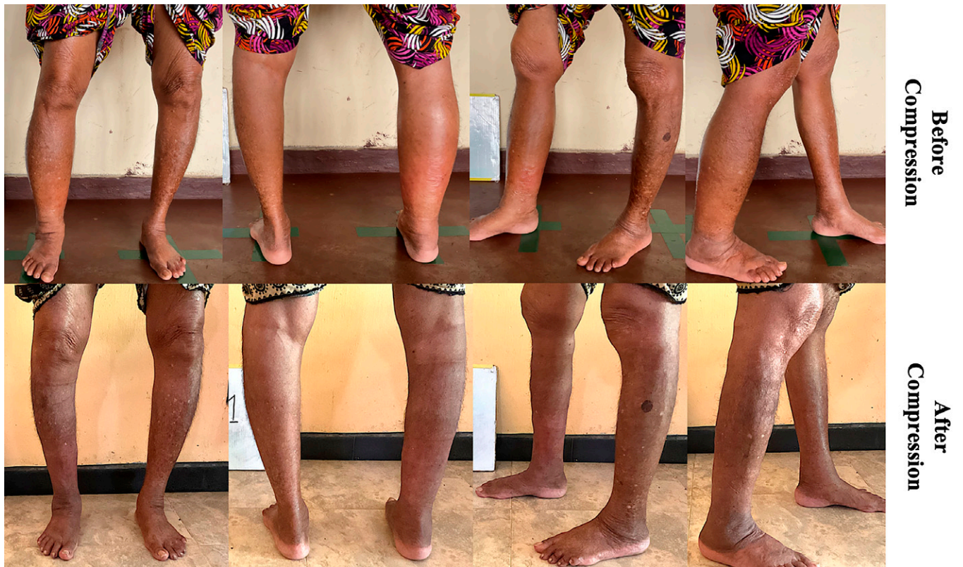
FIGURE 3. Clinical photographs comparing affected leg appearance enrollment to post-compression. Clinical photographs for an individual subject with an affected right lower extremity, comparing enrollment (day -28, top row) to post-compression (day 14, bottom row) appearance from anterior, posterior, left lateral, and right lateral views.

Most participants reported the garment as consistently comfortable, supportive, easy to use, and beneficial for their lymphedema. We observed that participants were motivated to continue use when provided estimated volume changes at serial visits. Mild discomfort associated with garment pressure or pruritus was rare and easily augmented with tension reduction or emollient application after garment removal, respectively. Only a few participants found use during sleep or all day to be somewhat cumbersome. At least