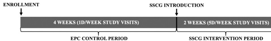
FIGURE 1. Study timeline. The study consisted of an essential package of care (EPC) control period for 4 weeks, in which participants were visited weekly by the study team. This EPC control period was followed by a short stretch compression garment (SSCG) intervention period for 2 weeks, in which the participants were visited 5 days a week by the study team.

consent, participants were trained to perform the EPC, including daily washing, drying, management of entry lesions, limb elevation, exercise, and shoe use outside/inside the home to protect limbs using the WHO's "New Hope for People with Lymphedema" manual. 14 Hygiene supplies, including a wash basin, soap, and towel, were provided at initial study visit. Complete study schedule of events is shown in Supplemental Appendix A. During the EPC control period, the study team visited each participant in their home weekly. This lead-in period allowed participants to demonstrate good EPC practices and provided multiple pre-compression volume measurements to establish a robust mean baseline volume.